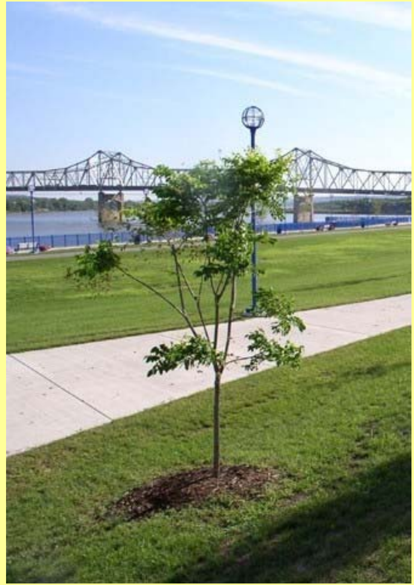
Peoria mud - before.....and 5 years later