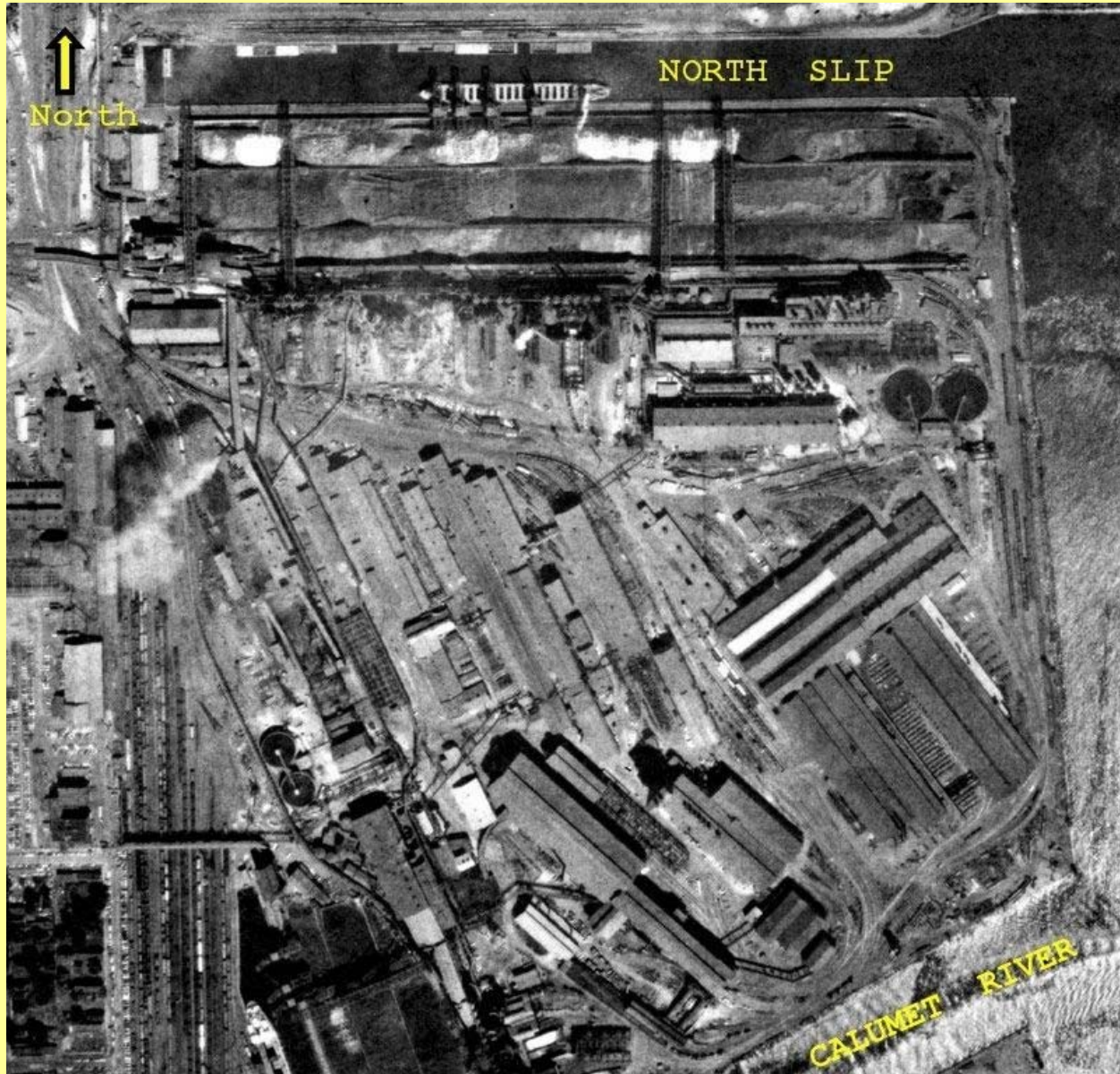
South half of site, steel operation in full production